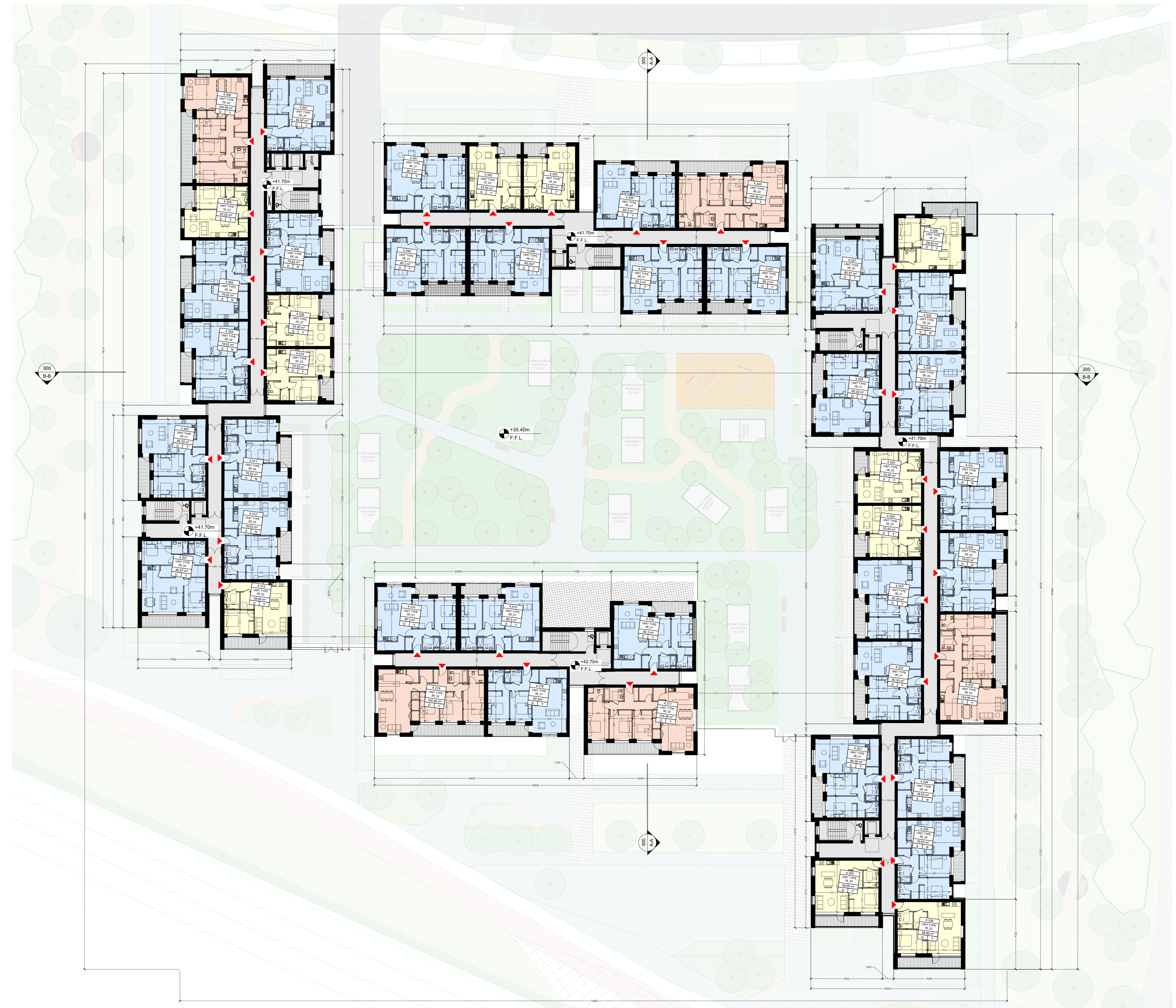
3rd Floor Plan - Block 4 Scale 1:200 @A0